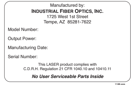
Figure 3. Laser certification and identification label.

Laser certification and identification labeling required by federal regulations have been combined in a single label located on the underside of the laser. A graphic representation of that label is shown in Figure 3. It certifies that this laser complies with federal regulations; identifies the manufacturer; and lists the model number and date of manufacture.