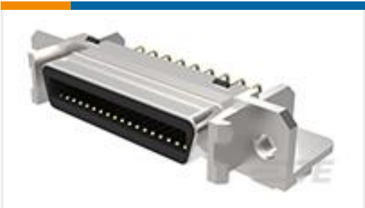
TE Part #2-5178238-2 CHAMP.050 REC ASS'Y 20P PB-FRE