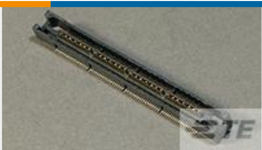
TE Part #2-5767004-5 MICTOR RECEPT ASSY, 152 POS.