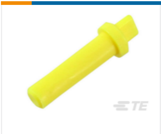
TE Part # 776363-1 SEALING PLUG, SZ 16 CAVITY