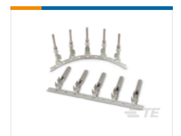
TE Part # CAT-AM7801-T273 Contacts: Size 16, 13A