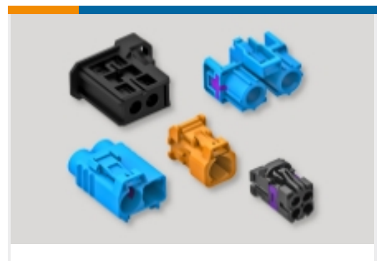
Data Connectivity Housings(3)