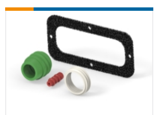
Connector Seals & Cavity Plugs(4)