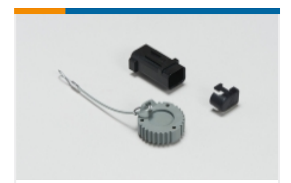
Automotive Connector Caps & Covers (1)