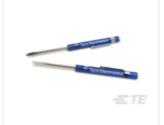
TE Part # CAT-AM7801-T618 Removal Tools — AMPSEAL 16