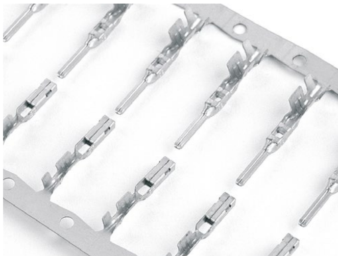
APEX ® 1.5 Female & Male Terminals